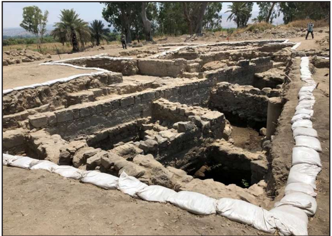
El-Araj Excavation Project

Bottom Right: A Roman-era dwelling was unearthed in Area C, about 100 meters north of the main site. The excavators say this is evidence of the size of the settlement at el-Araj in the first century AD.