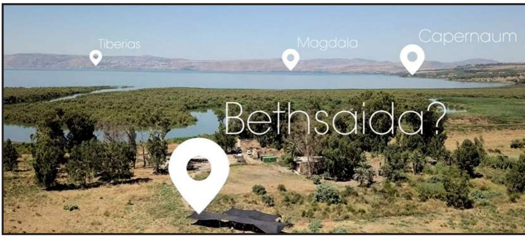
HaDavar Yeshiva, El-Araj Excavation Project

Aerial View towards the Sea of Galilee: In this screen capture from the video, “Why el-Araj?” one can see the proximity of el-Araj to the Sea of Galilee and other ancient villages.