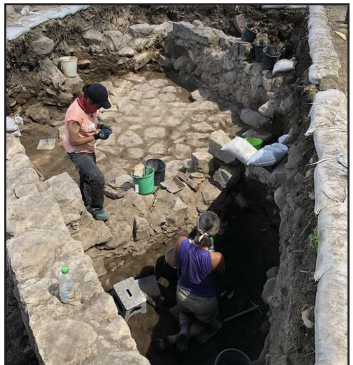
El-Araj Excavation Project