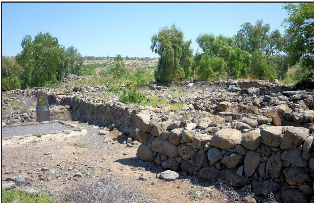
Drahnier / Wikimedia Commons

proposed. However, there are numerous plains and hills which would hold large numbers of people, 7 as required by the account of the feeding of the five thousand and the battles Josephus describes.